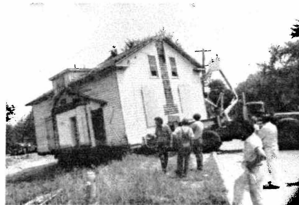
Moving to 148 John Street. Weaver #42.