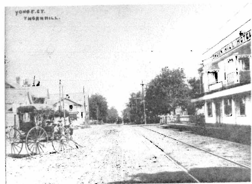
The old Thornhill Hotel, which burned in 1950. Weaver #290.

Council can also deviate from approved policies on a case by case basis if it deems it appropriate.