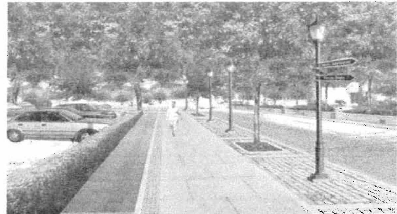
Interim Landscape Improvements

Conceptual illustrations of potential streetscape treatments from the Thornhill Yonge Street Study 2005 as prepared by Urban Strategies Inc.