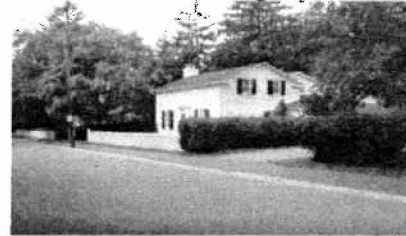
Landscaping is a significant element in the District character

Often landscape features surrounding a building, such as gardens and fences, can help express the character of both the specific building and the heritage environment.