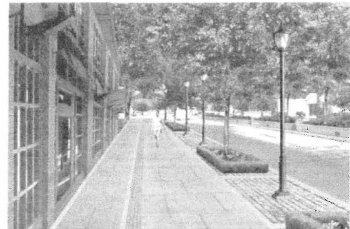
Over the long term, the Yonge Street Base Case Streetscape, together with Mandatory Private Streetscape Contributions secured through the redevelopment process, will create a distinct public realm for the study area.